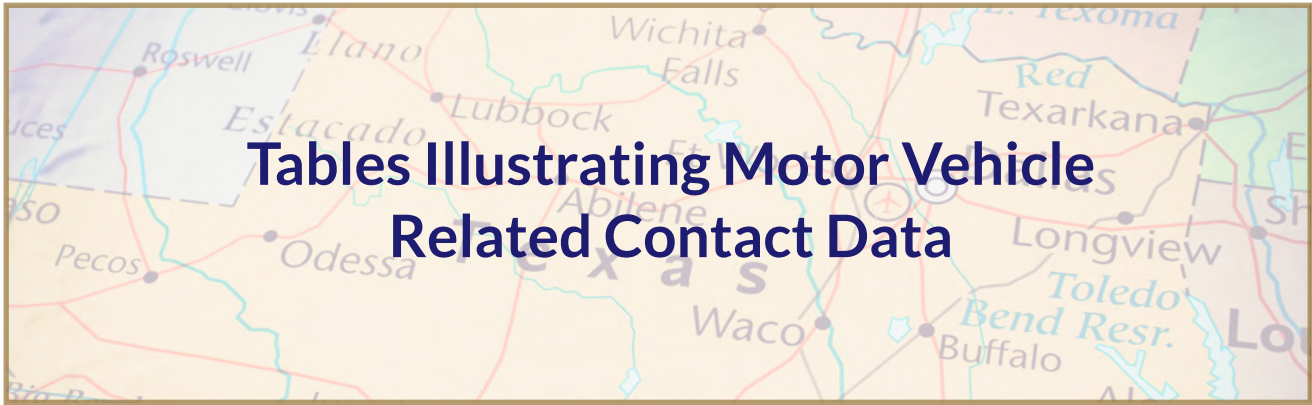
Table 1. Citations and Warnings